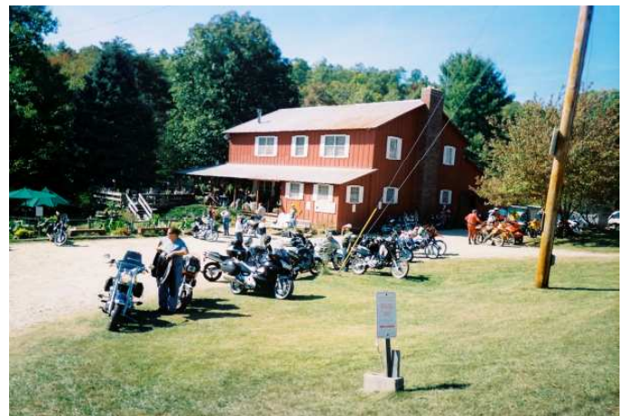
TWO motorcycle resort on Rt. 60 in Suches, GA